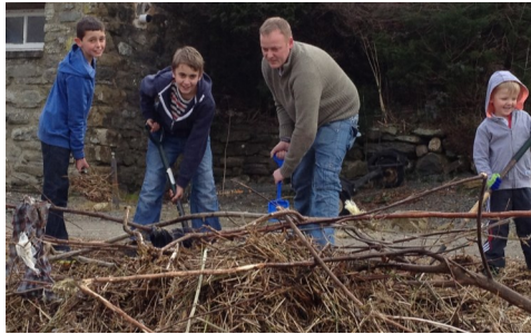
Some of Last year's teams in action– debris removal is always a big job