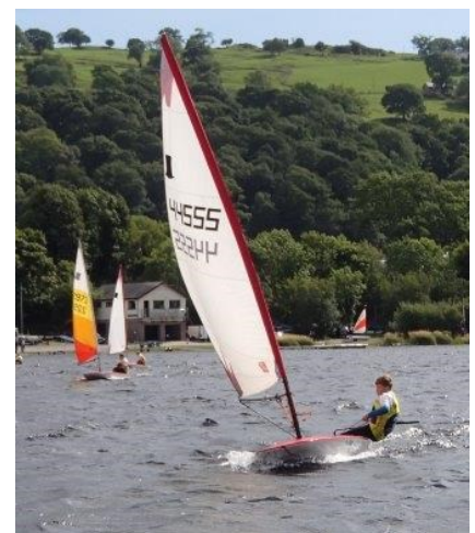
Bala juniors in action