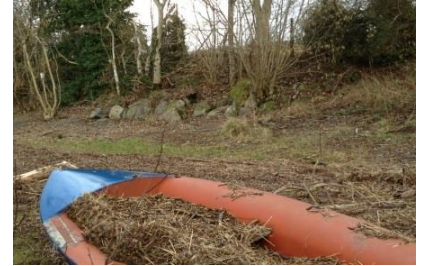
If this is yours, we don't like to say we told you so, but...

As always, there's plenty to be done! The combination of winds and high rain we've had over the winter should mean plenty of debris needs clearing from the foreshore, and a JCB has been booked to deal with replacing the shingle etc, but plenty of help with rakes and barrows, plus a trailer or 2 for removing the other debris would be appreciated. As we store boats etc in the clubhouse and the upper floor of the race box, these areas can't be cleaned until the foreshore is in a fit state to get the boats out . So 1st March will be mainly for outdoor work– let's hope we get the weather!