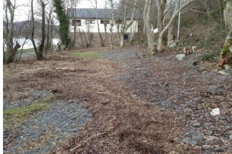
This year's storms have thoroughly cleared the foreshore, but there's plenty on the high water line!